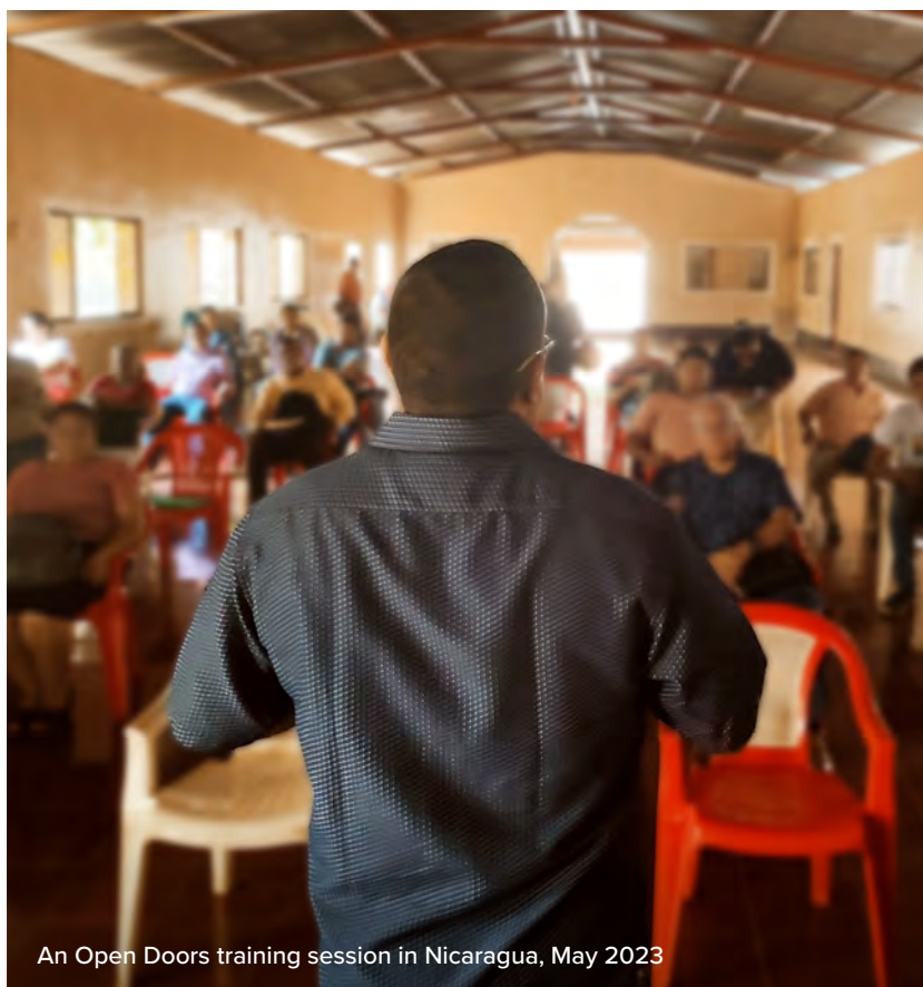
An Open Doors training session in Nicaragua, May 2023