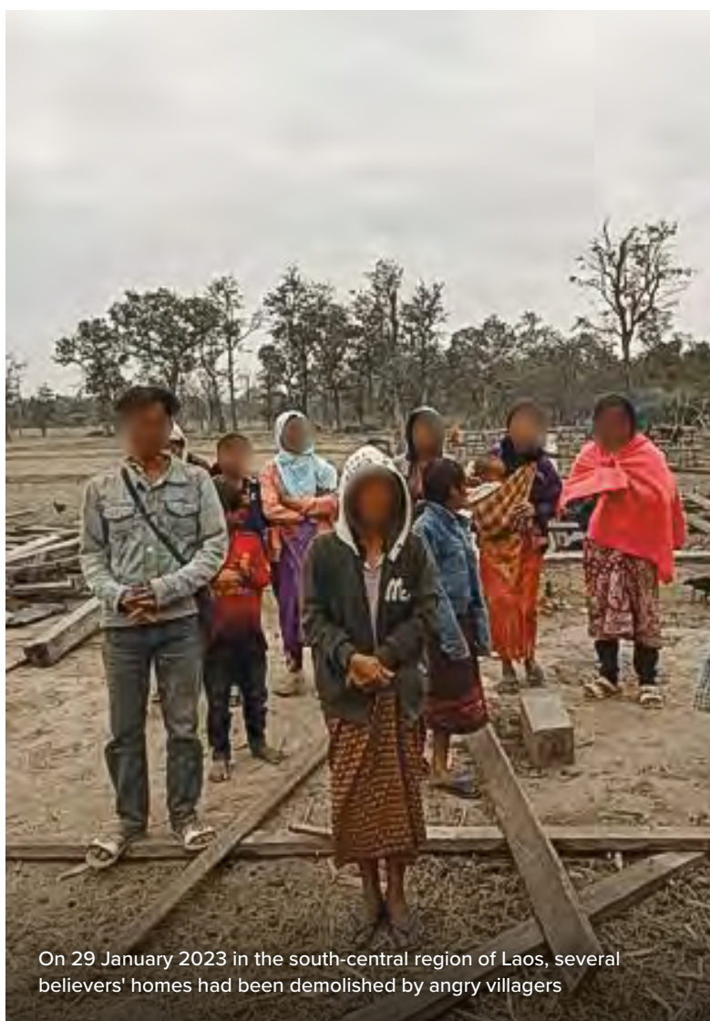
On 29 January 2023 in the south-central region of Laos, several believers' homes had been demolished by angry villagers

In Laos , four Christians were killed during the 2024 World Watch List reporting period, though such killings had not occurred for many years. This, along with a rise in attacks on churches, Christians' homes and businesses and also in arrests of Christians, caused Laos to rise ten places on the 2024 World Watch List, from rank 31 to 21. Christians active in evangelism run the risk of deadly community opposition. This dramatic change has had a chilling effect on the wider Church (e.g., as Christian leaders decide not to travel alone for ministry engagements).