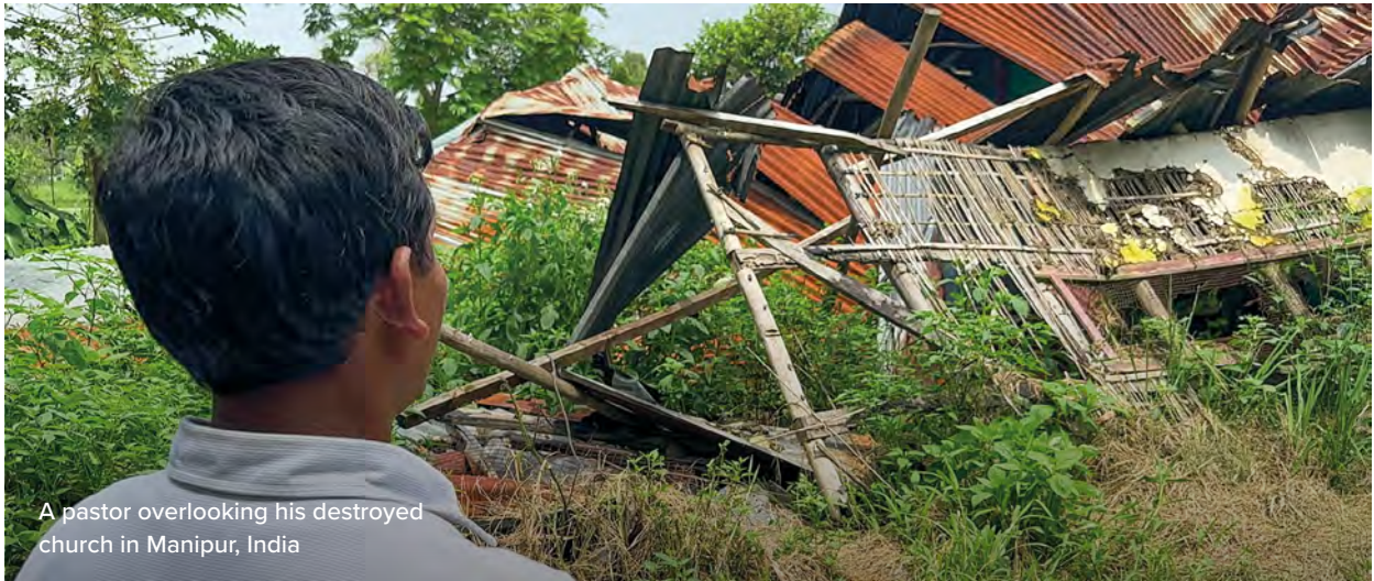
A pastor overlooking his destroyed church in Manipur, India