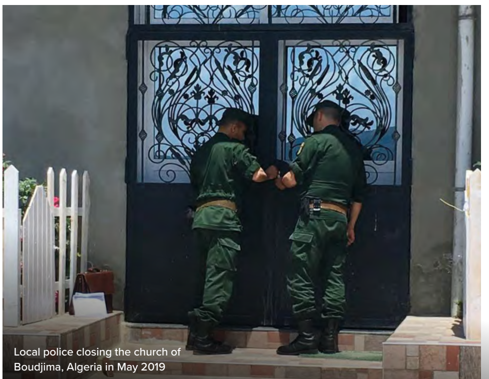
Local police closing the church of Boudjima, Algeria in May 2019

As a result of this government action, pressure has increased to such an extent that the few remaining churches will have to consider ceasing all visible activities in 2024.