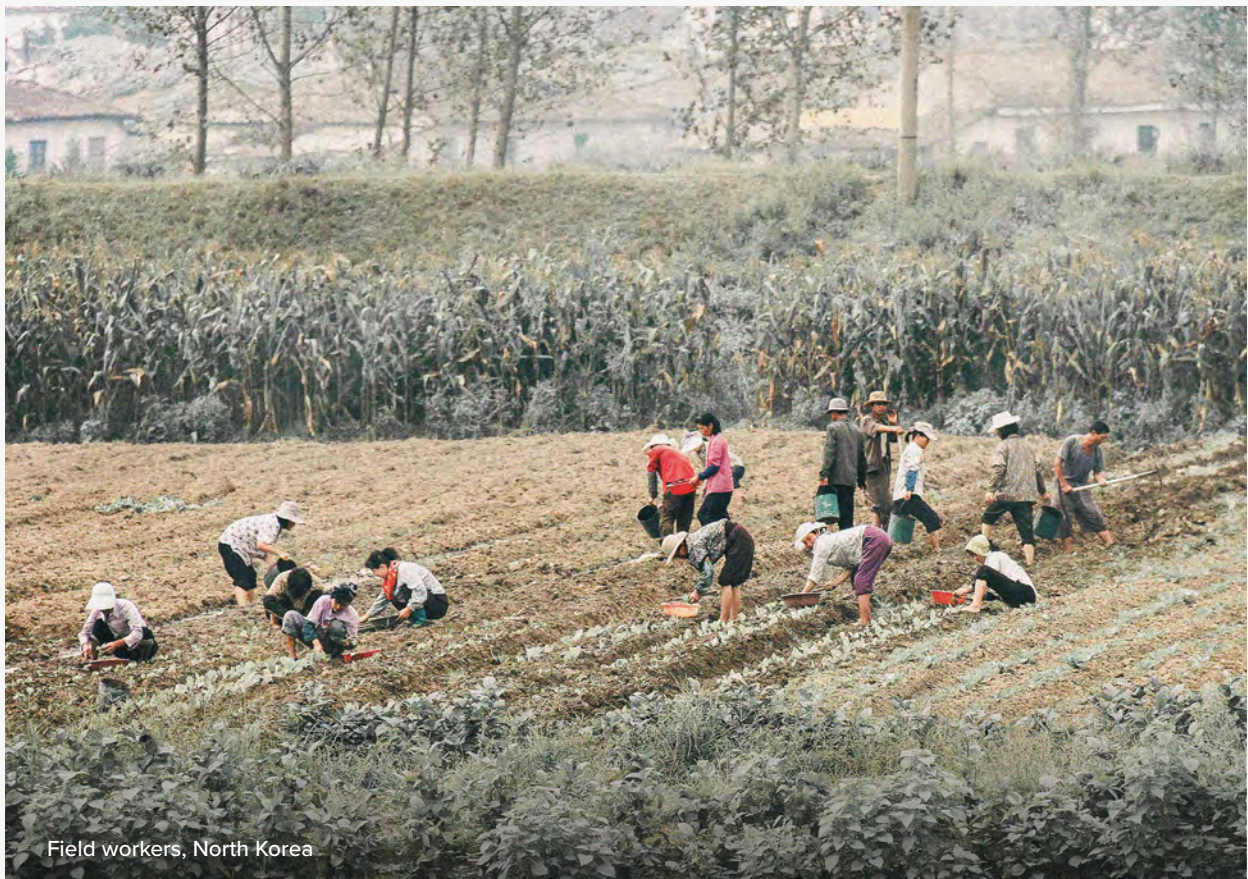
Field workers, North Korea

If you are a government official, civil servant, NGO staff or journalist and would like to receive Open Doors’ briefing materials, or would like further information, please contact Open Doors International Advocacy team at advocacy@od.org .