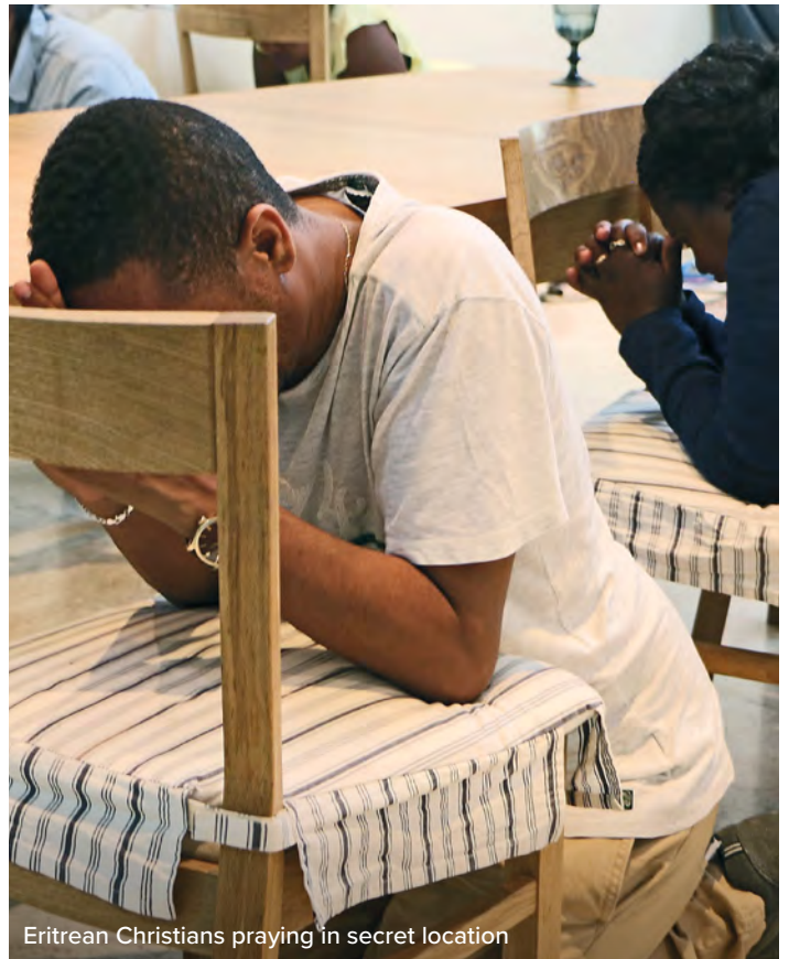
Eritrean Christians praying in secret location

Since the war started in April 2023, more than 12,000 have been killed, 10 around 5.3 million people have been internally displaced, with around 1.3 million people crossing into neighbouring countries. 11 There have been reports of crimes against humanity, 12 such as snipers targeting civilians in West Darfur. 13 As tensions continue, there is growing concern that Christians are being targeted or suffering as collateral damage in the broader violence. Churches may also find themselves entangled in internal conflicts, such as in Ethiopia , where the number of attacks on churches and public