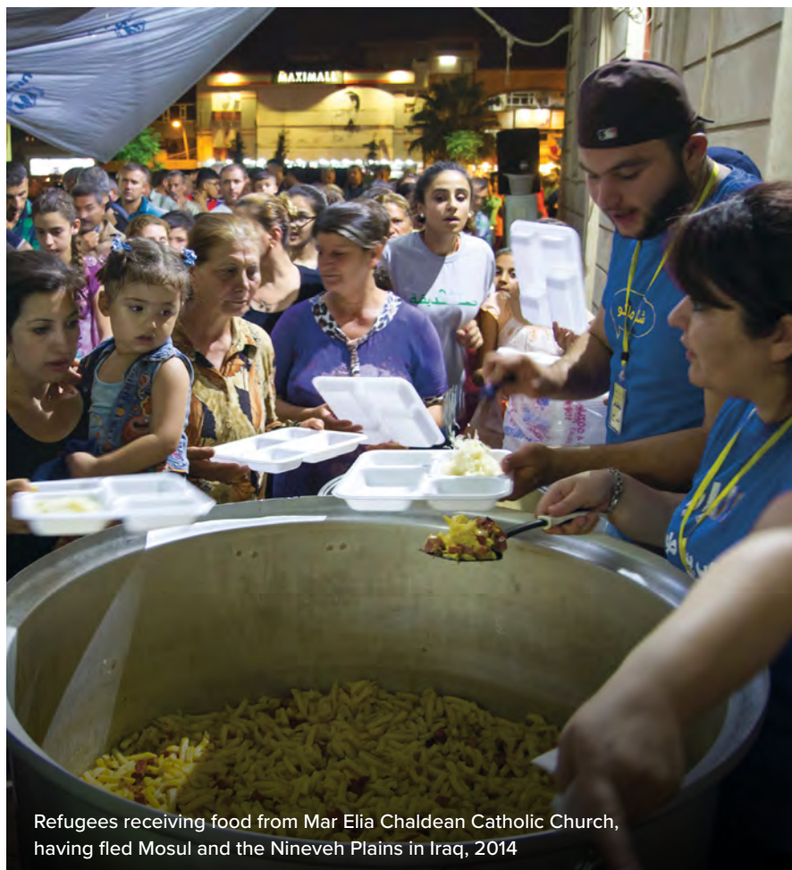
Refugees receiving food from Mar Elia Chaldean Catholic Church, having fled Mosul and the Nineveh Plains in Iraq, 2014

As a result of the earthquake, nine out of ten people who had