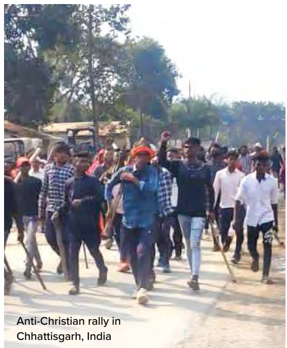
Anti-Christian rally in Chhattisgarh, India