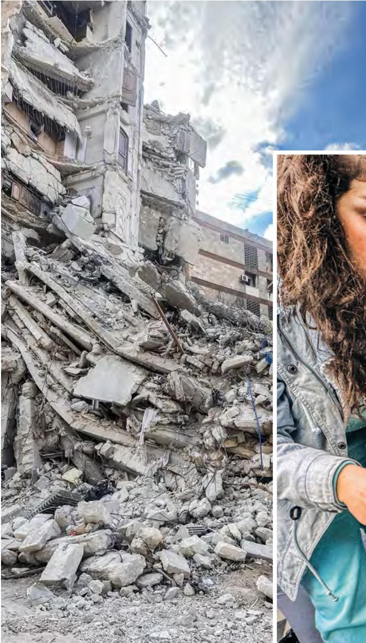
[LEFT] Earthquake destruction in Aleppo, Syria in February 2023