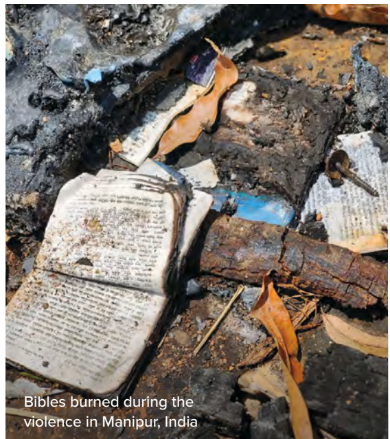
Bibles burned during the violence in Manipur, India