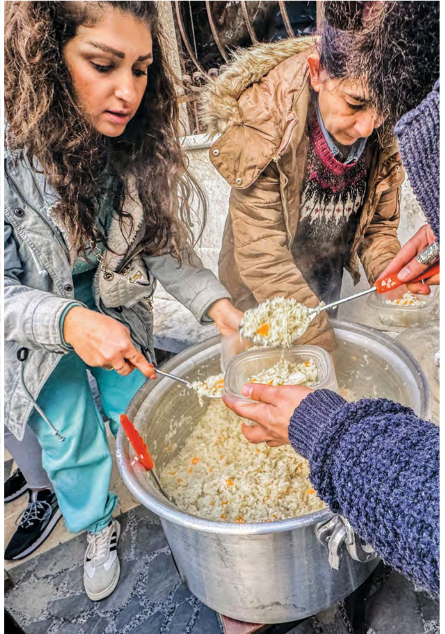
[BELOW] Earthquake survivors receiving food aid and shelter in Maronite Church, Latakia, Syria

already fled the war's violence to live in displacement camps were displaced yet again. 20 The earthquake "not only destroyed more homes, schools and places for children to play, they also shattered any sense of safety for so many of the most vulnerable children and families," according to the Executive Director of UNICEF. 21 Christian children already had been particularly vulnerable to such a shock, as many Christian schools had been closed or damaged because of the war and children have had to