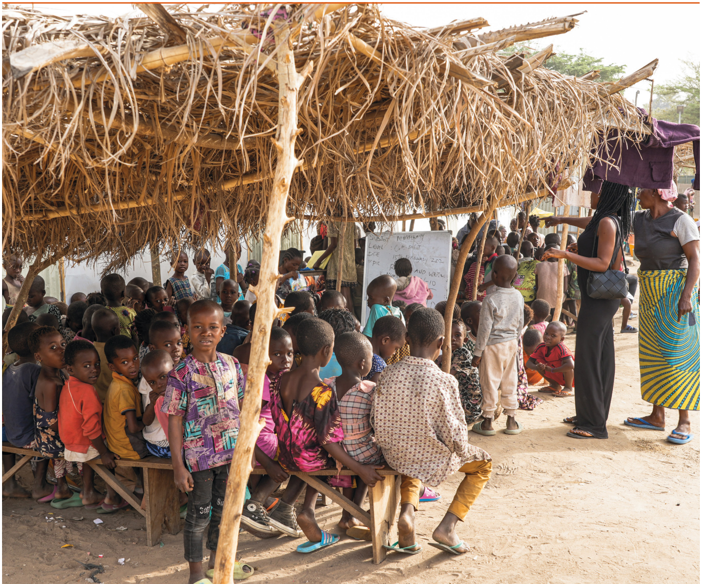
A school class taking place in a Christian refugee camp, Benue state.

To further develop and strengthen the research, interviews could be conducted across a greater range of Christian denominations and widened to include multiple religious communities. There could also be a greater gender balance across interviewees. Quantitative research could prove additionally beneficial in gaining more accurate numbers around the scale of displacement and the religious affiliation of IDPs. 63