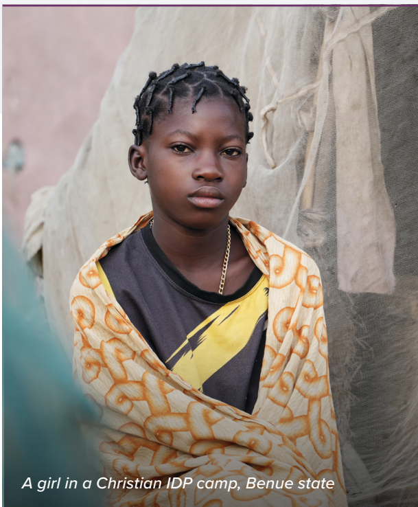
A girl in a Christian IDP camp, Benue state

Defining Internally Displaced Persons (IDPs): “persons or groups of persons who have been forced or obliged to flee or to leave their homes or places of habitual residence, in particular as a result of or in order to avoid the effects of armed conflict, situations of generalized violence, violations of human rights or natural or human-made disasters, and who have not crossed an internationally recognized state.” 6