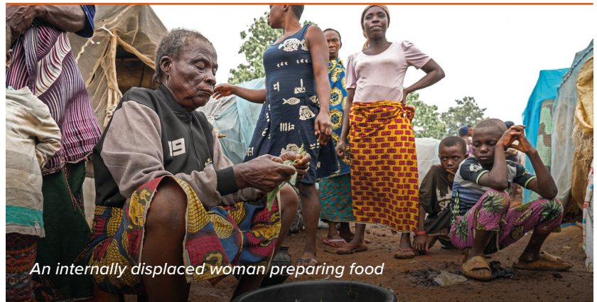
An internally displaced woman preparing food