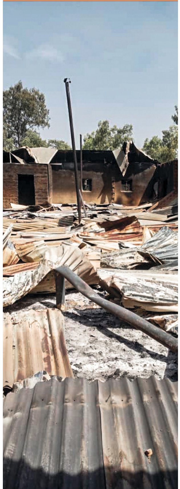
Destruction following attacks carried out in Plateau state by militant Fulani militants on Christmas 2023.

“In Kantoma, the Fulani attacked us. We didn't know that anything was going on. Our men were alerted that the Fulanis are coming. We were warned by men to move out quickly. Before we knew what was happening the village was surrounded by the Fulanis. There were many of them. Many of our men were killed, about 39 of them were killed. We couldn't farm even in the past year. There is no food or shelter. Everything was destroyed. Even this week, there were attacks. Our people are also into tin mining which has been supporting us economically, but this has been affected by this crisis. Some of our people who were bold to go back to tin mining, were attacked. Our schools have been destroyed. Many of our people have been killed. Fulani [militants] have been destroying what is left, even the houses that are standing. There is no food in the camp. We are seriously in need.” – A Christian IDP interviewee 61