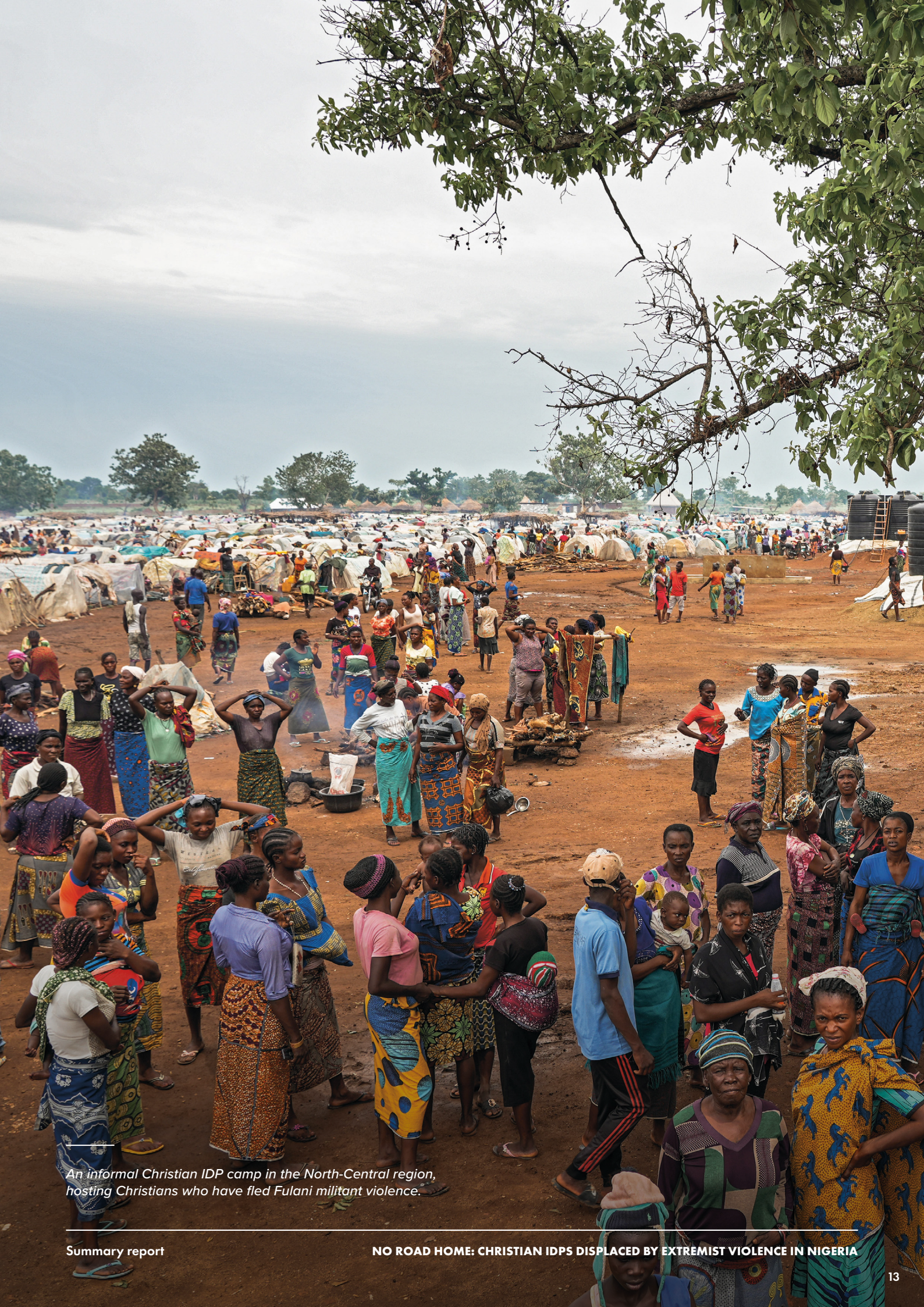
An informal Christian IDP camp in the North-Central region, hosting Christians who have fled Fulani militant violence.