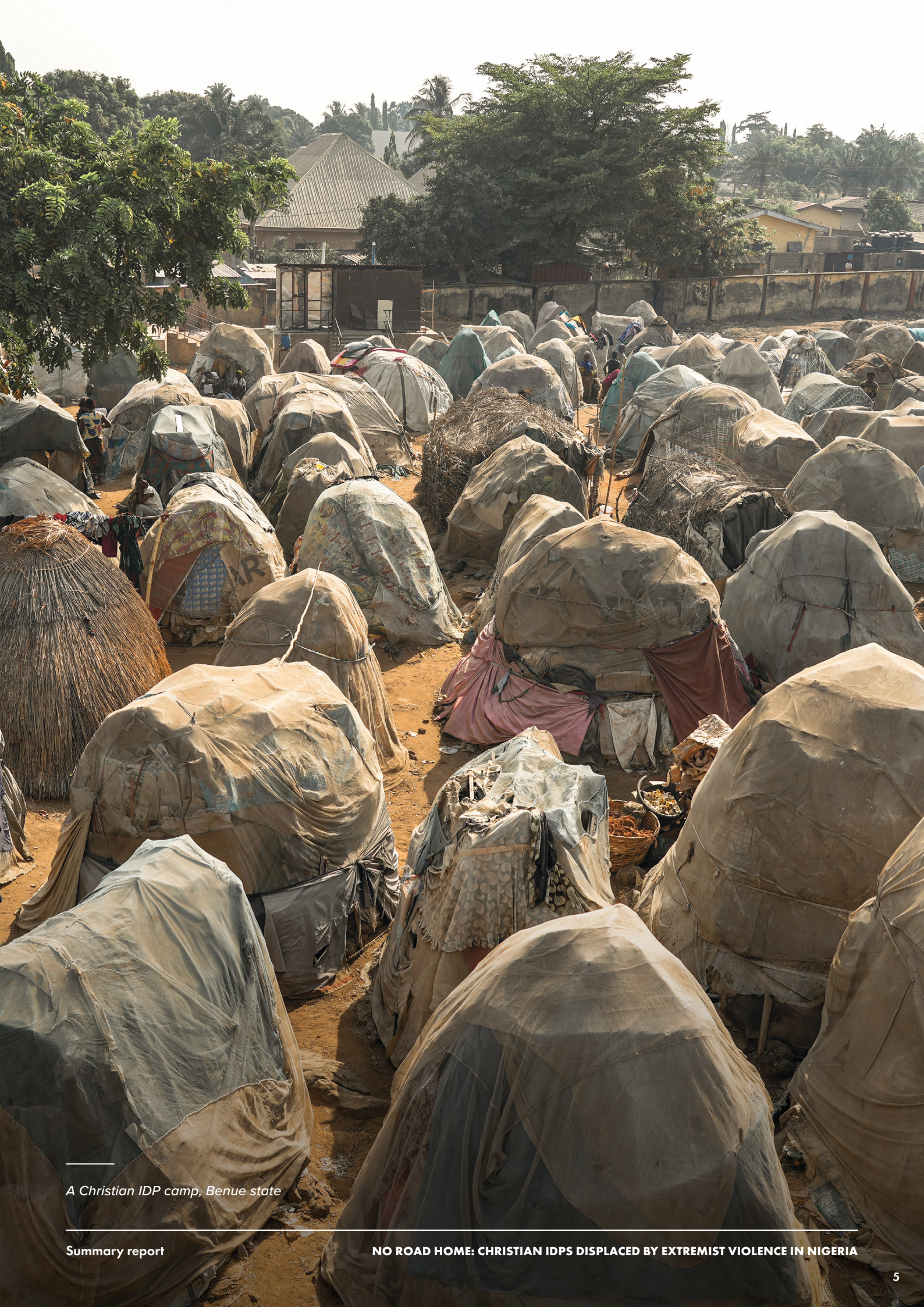
A Christian IDP camp, Benue state